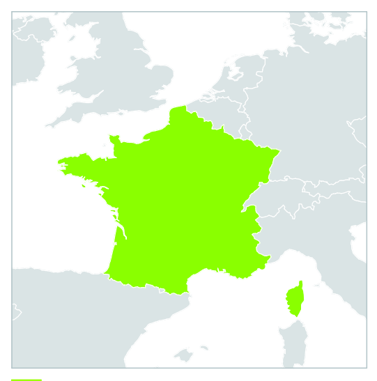
~100 % detailed street network