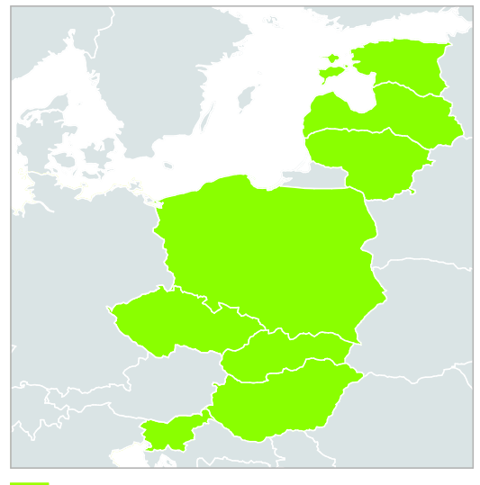
\sim 100 % detailed street network